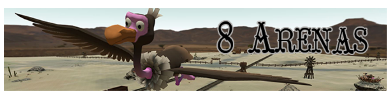
Visit 4 PvE and 4 PvP arenas with their unique features and quirks.

The game contains many objects with individual physical behaviours. Enjoy breaking bottles, splitting bones, cutting wood, or just blowing stuff up. And yeah, the birds.